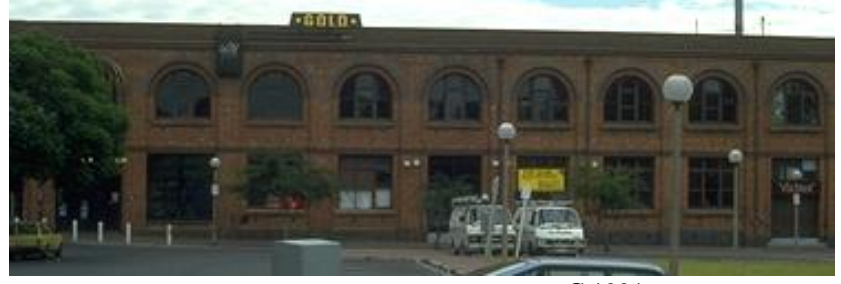
C 1991 (CD Ref 3982/51)

owned by Goldsbrough Mort and Company. This and subsequent changes of ownership exemplified the rationalisation of the many stock and station agencies which has taken place this century.