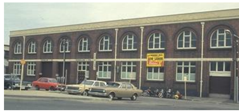
C 1982 (CD Ref 3982/52)

This building is historically significant because it was built for Bagot, Shakes and Lewis, which was a major stock and station agency in South Australia in the early twentieth century. It is a good example of the type of imposing industrial buildings which were constructed on the periphery of the central business area. The building was later