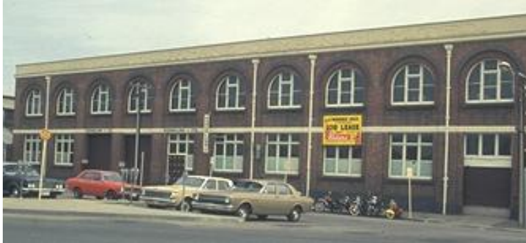
C 1982 (CD Ref 3982/52)

owned by Goldsbrough Mort and Company. This and subsequent changes of ownership exemplified the rationalisation of the many stock and station agencies which has taken place this century.