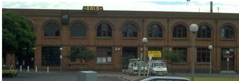
C 1991 (CD Ref 3982/51)

owned by Goldsbrough Mort and Company. This and subsequent changes of ownership exemplified the rationalisation of the many stock and station agencies which has taken place this century.