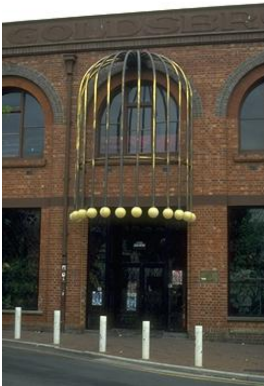
C 1991 (CD Ref 3982/49)

The architectural merit of this building lied primarily in its solid utilitarian construction, and the use of materials which link it with other notable brick buildings in the north and west of the Square. The building is well constructed, and is notable for the repetitive arches which distinguish it from its neighbours.