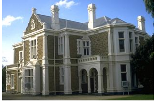
(CD Ref 1606/37)

Henry Rymill died in 1927 but the family owned the house until 1950. It was then acquired as a training centre by the Post Master General and so used until 1982. Although the grounds are in a poor state and the building has suffered from subsidence, it is a very prominent part of East Terrace and one of the most gracious of the residences which once characterised the south-east corner of the city. These qualities are enhanced by its generous siting on land in excess of one town acre.