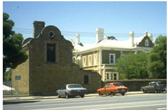
(CD Ref 1606/38)

The detailing of both the house and coach house is consistent and of a high order. The masonry is of squared, random coursed sandstone with stuccoed dressings. The internal detailing of the house includes elaborate elements such as chimney-pieces, stair hall and stained-glass. The architectural impact of the unusually prominent four main elevations remains of a high order with little or no counterpart in the city.