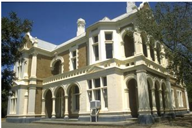
(CD Ref 1606/42)

. . . one of the best houses in the City, both from its admirably arranged plan and the effective character of the whole four elevations which are carried out in brown stone with Sydney stone and cement dressings in the Queen Anne style.