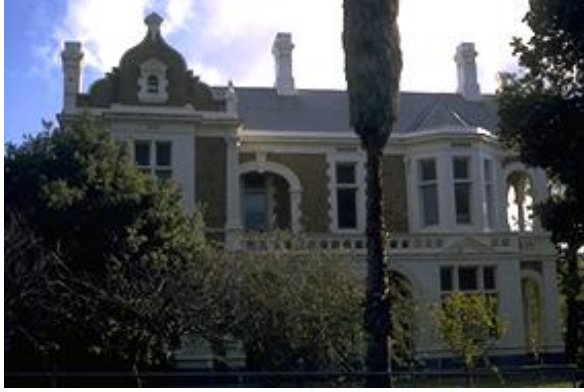
(CD Ref 1606/36)