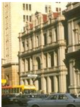
(CD Ref 3964/65)

Situated in a prominent position in the heart of the city, the building has a frontage of 105 feet to King William Street on the east and faces the entire length of Savings Bank Place.