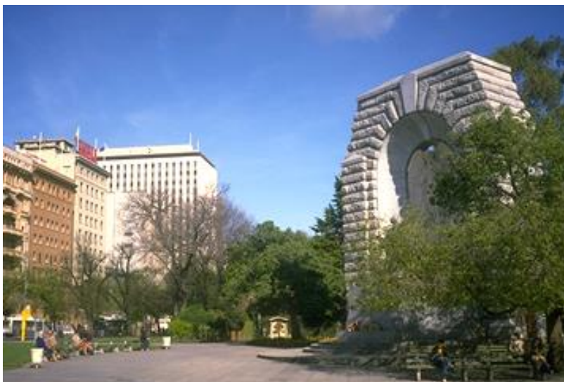
(CD Ref 2835/58)