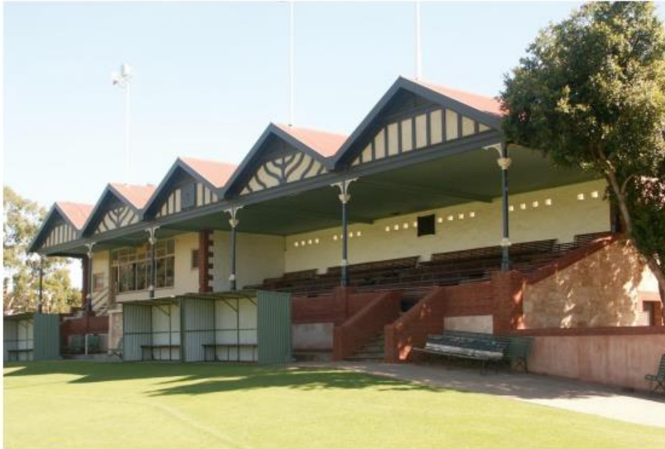
University of Adelaide Grandstand from oval (from east)