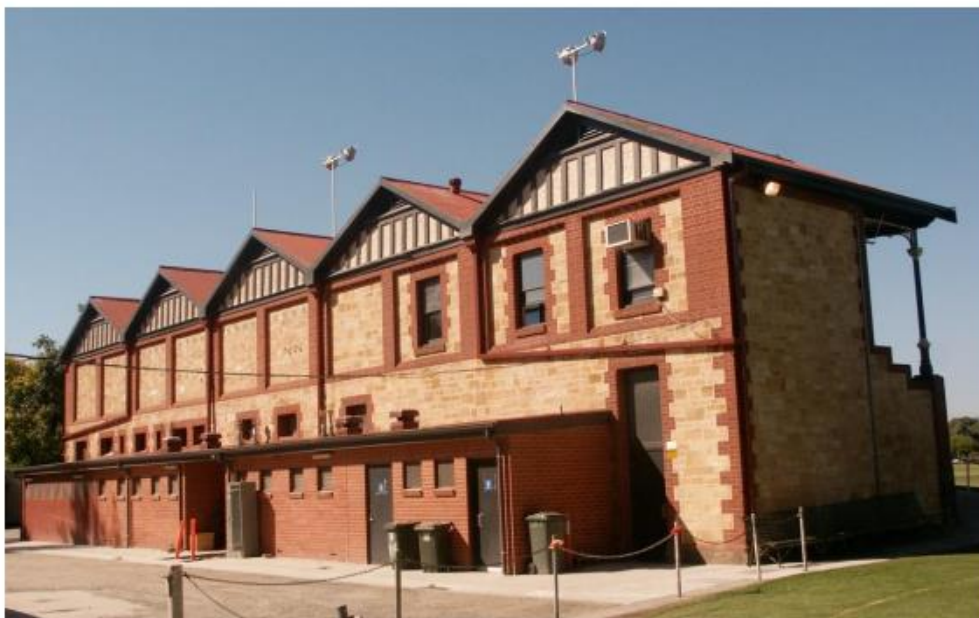
University of Adelaide Grandstand from rear (from west)