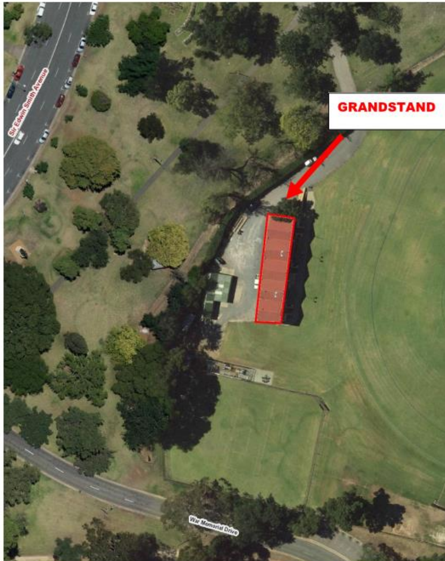
University of Adelaide Grandstand Site plan generally indicating the important elements and features of the place (outlined in red)