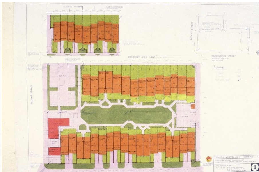
Manitoba Housing Complex, Carrington Street, Adelaide – Plan of Medium Density site: Layout Plan [1974] (SAHT, MAN 0002)

[Note, the section on the northern side of Hume Lane (aka Proposed A.C.C. Lane), which was built as Stage 2 of Manitoba, is not included as part of this Place]