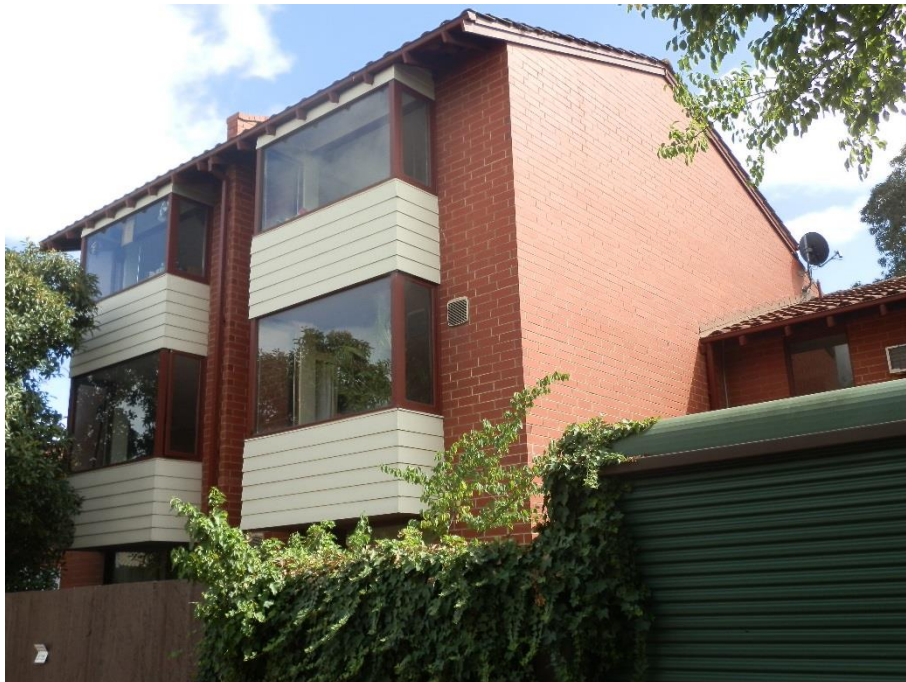
Manitoba Housing Complex, Carrington Street, Adelaide – Two and three storey units on Carrington Street (looking north) (, March 2014)