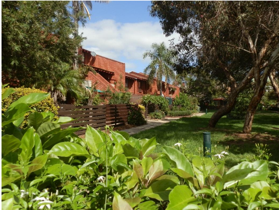
Manitoba Housing Complex, Carrington Street, Adelaide - Rear of Carrington Street units, viewed from central space showing their private gardens (looking south) (S Marsden, March 2014)