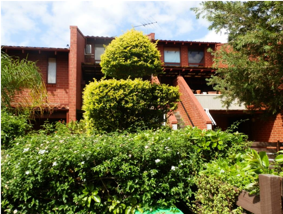
Manitoba Housing Complex, Carrington Street, Adelaide - Rear of Carrington Street units, viewed from central space showing their private gardens (looking south) (S Marsden, March 2014)