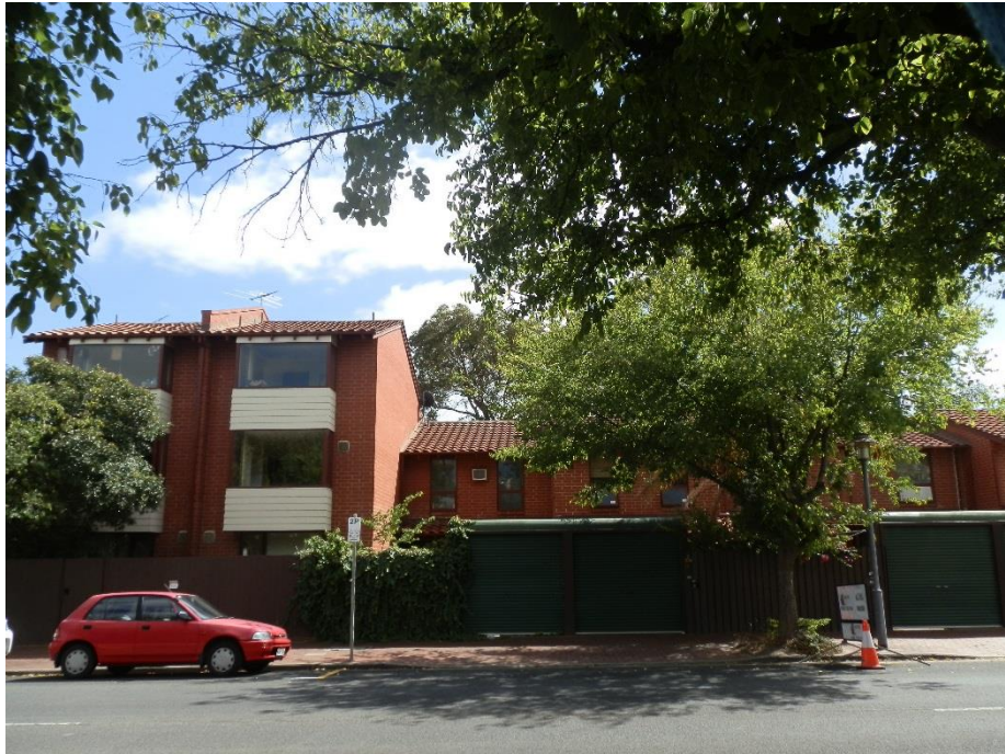
Manitoba Housing Complex, Carrington Street, Adelaide – Two and three storey units on Carrington Street (looking north)