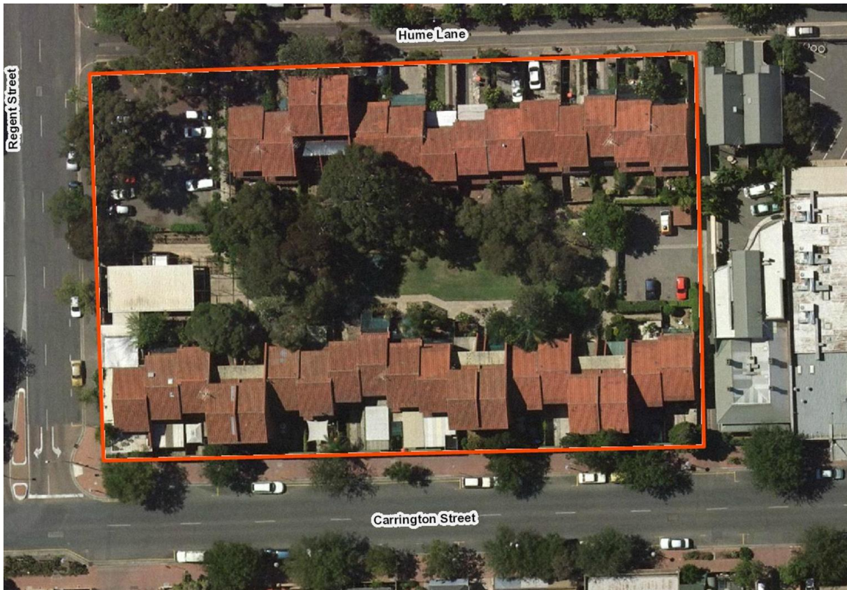
Manitoba Housing Complex, Carrington Street, Adelaide – Site Plan

[Generally indicating the important elements and features of the place (outlined in red)]