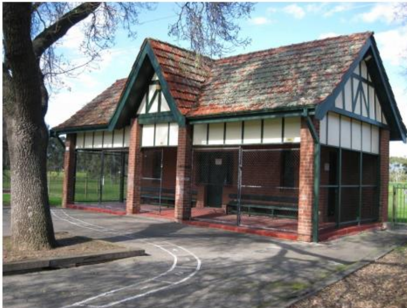
Shelter Shed, Princess Elizabeth Children's Playground, South Terrace, Adelaide View from north-west