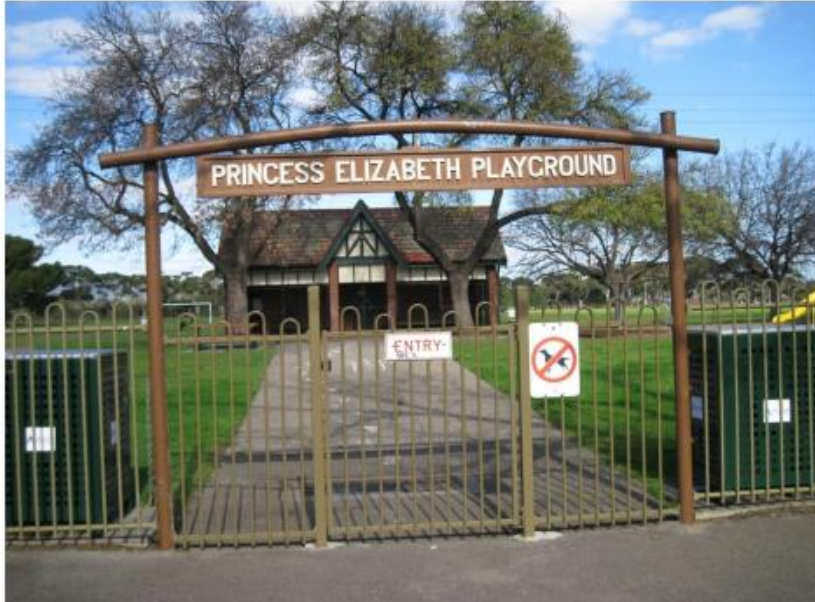
Entrance, Princess Elizabeth Children's Playground, South Terrace, Adelaide View to the south