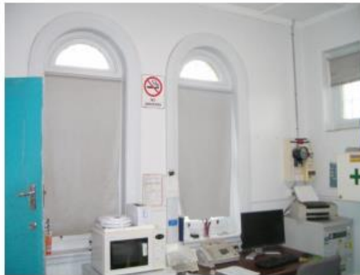
Former Torrens Lake Police Station - interior of former charge room