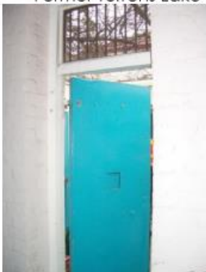
View to west from the holding cell, now store to the exercise yard