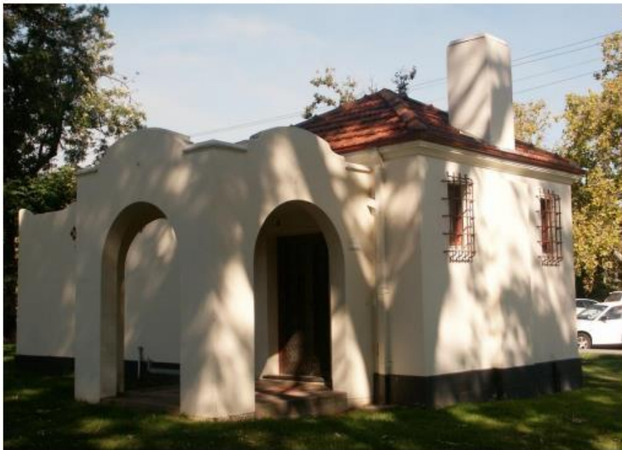
Former Torrens Lake Police Station – view to the south-east