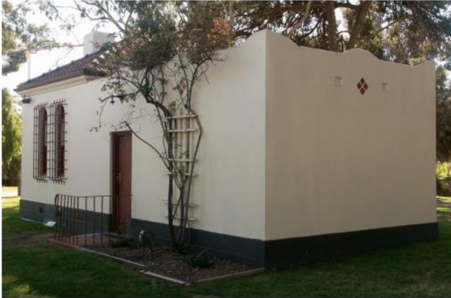
Former Torrens Lake Police Station - View to the north-west showing exterior of the wall to the exercise yard and holding cell with entry to the yard.