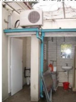
View north from the exercise yard showing toilet