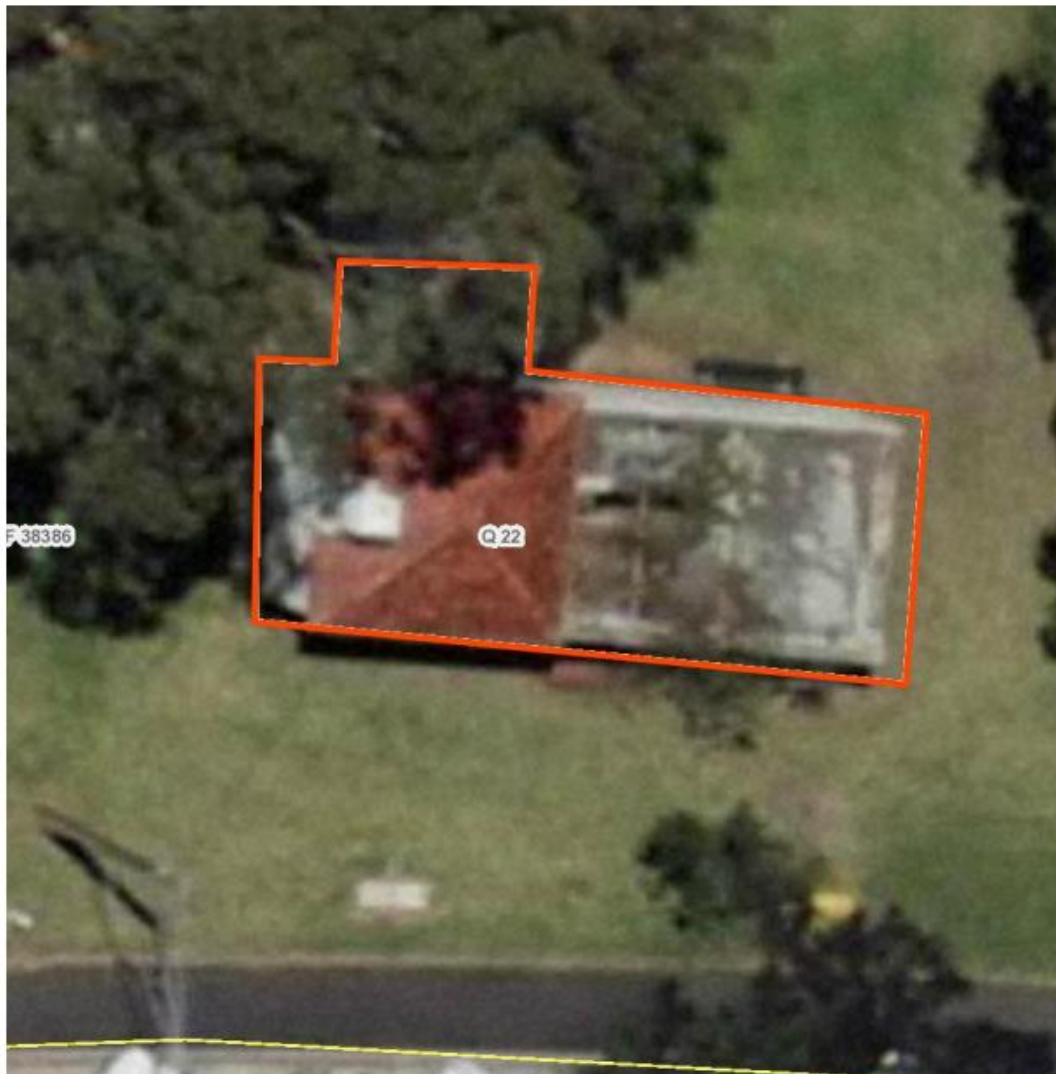
Former Torrens Lake Police Station (Note: Portico obscured by trees) Site plan generally indicating the important elements and features of the place (outlined in red)