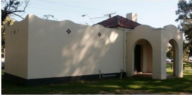
Former Torrens Lake Police Station - view to the south-west