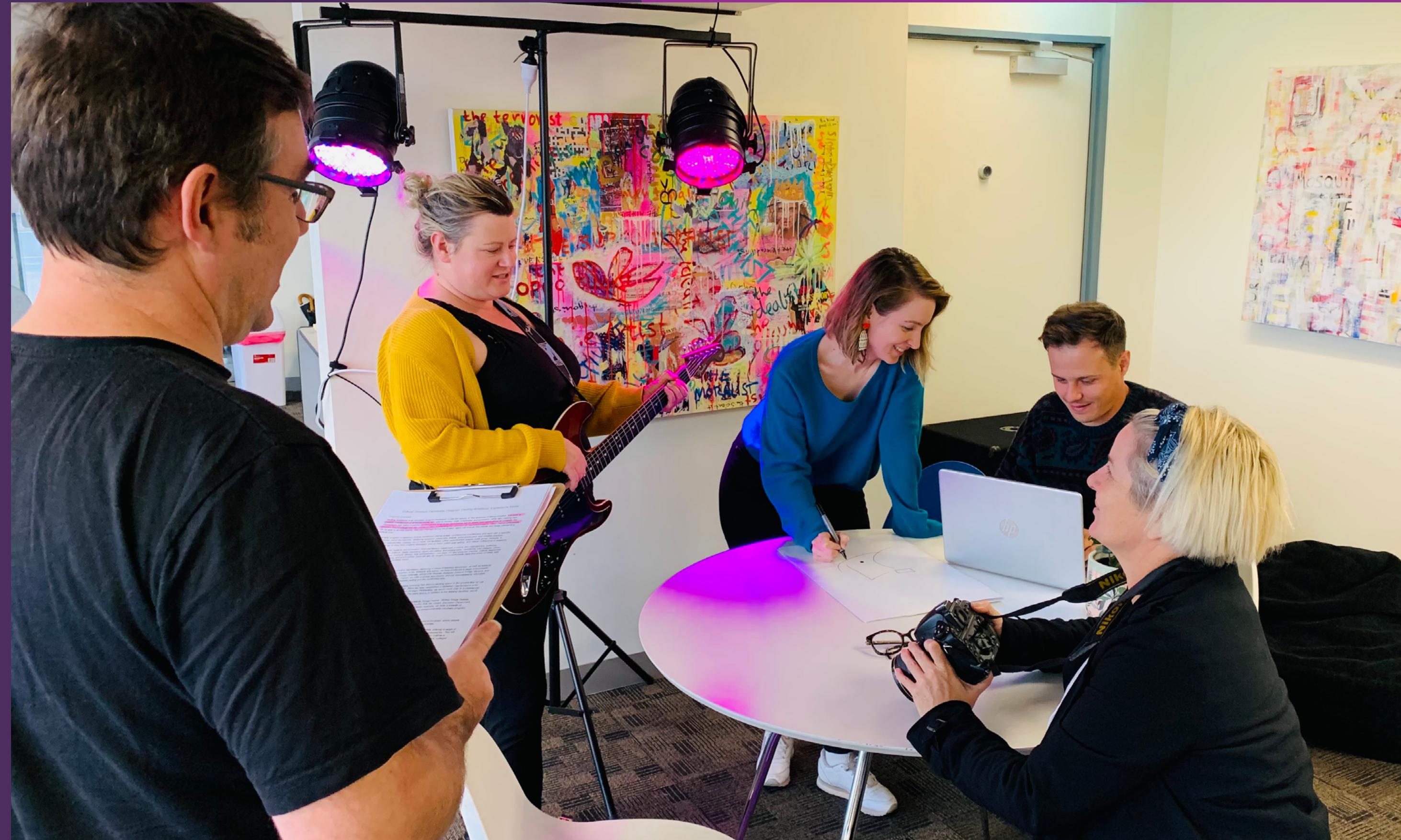
Creative Entrepreneurs Program Vaulting Ambitions 2021.