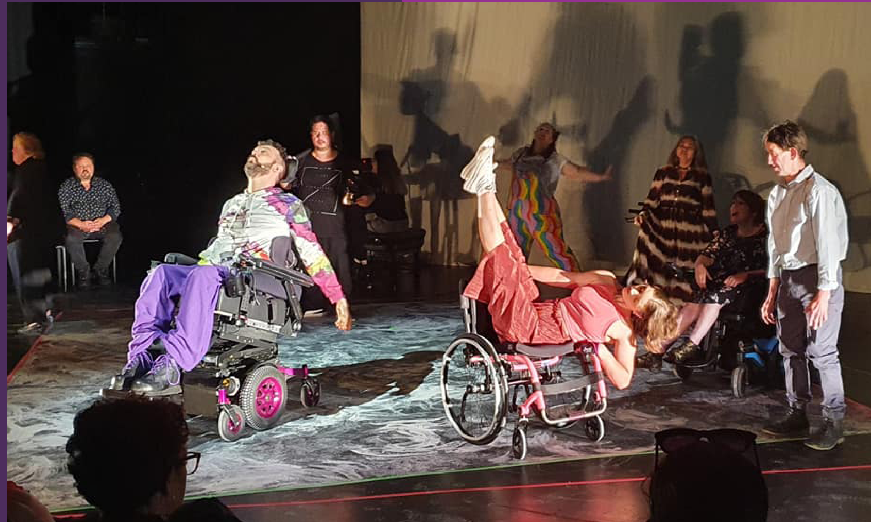
UnSeen performance presented by True Ability in partnership with City of Adelaide. December 2021.