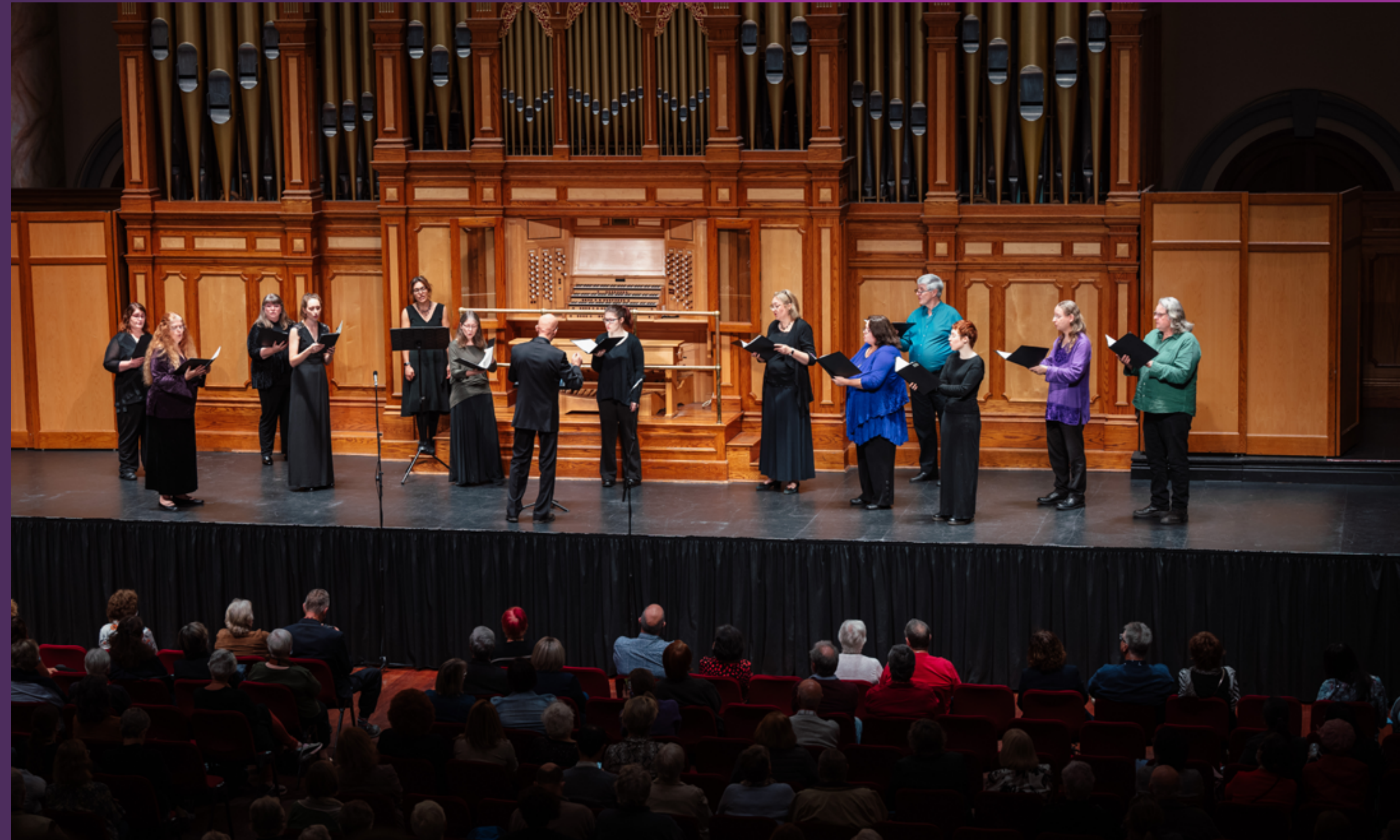
Image: Lumina Vocal Ensemble performing at Adelaide Town Hall 2022.