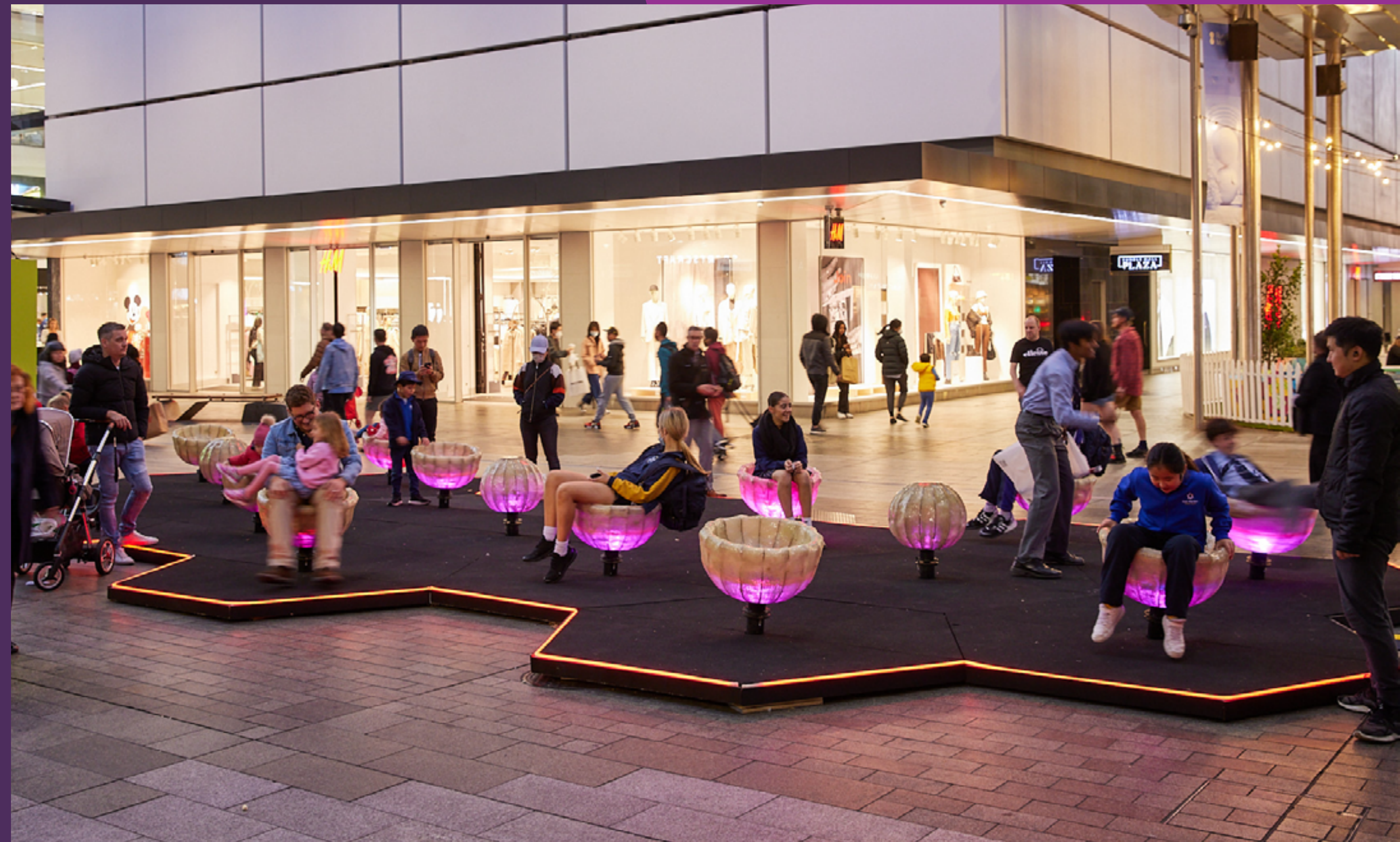
Image: Pulsing Heart, HEXADECA , 2022, 11m x 12.6m. Rundle Mall.